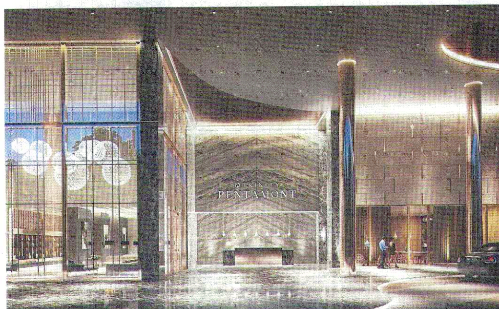
Trinity Pentamont exuding grandeur at all fronts

Developer brings adventure-themed luxury living experience to Mont' Kiara