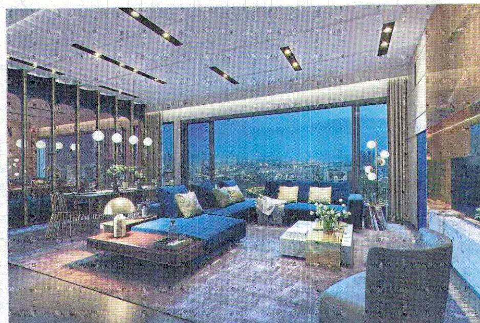
Fancy yet cosy penthouse-size units for families.