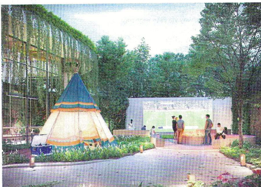
Quality facilities serve the residents of Trinity Pentamont.

TRINITY PENTAMONT IS A SHORT DISTANCE FROM SEVERAL EDUCATIONAL INSTITUTIONS SUCH AS GARDEN INTERNATIONAL SCHOOL, MONT KIARA INTERNATIONAL SCHOOL, TAYLOR'S COLLEGE AND FRENCH SCHOOL OF KL.